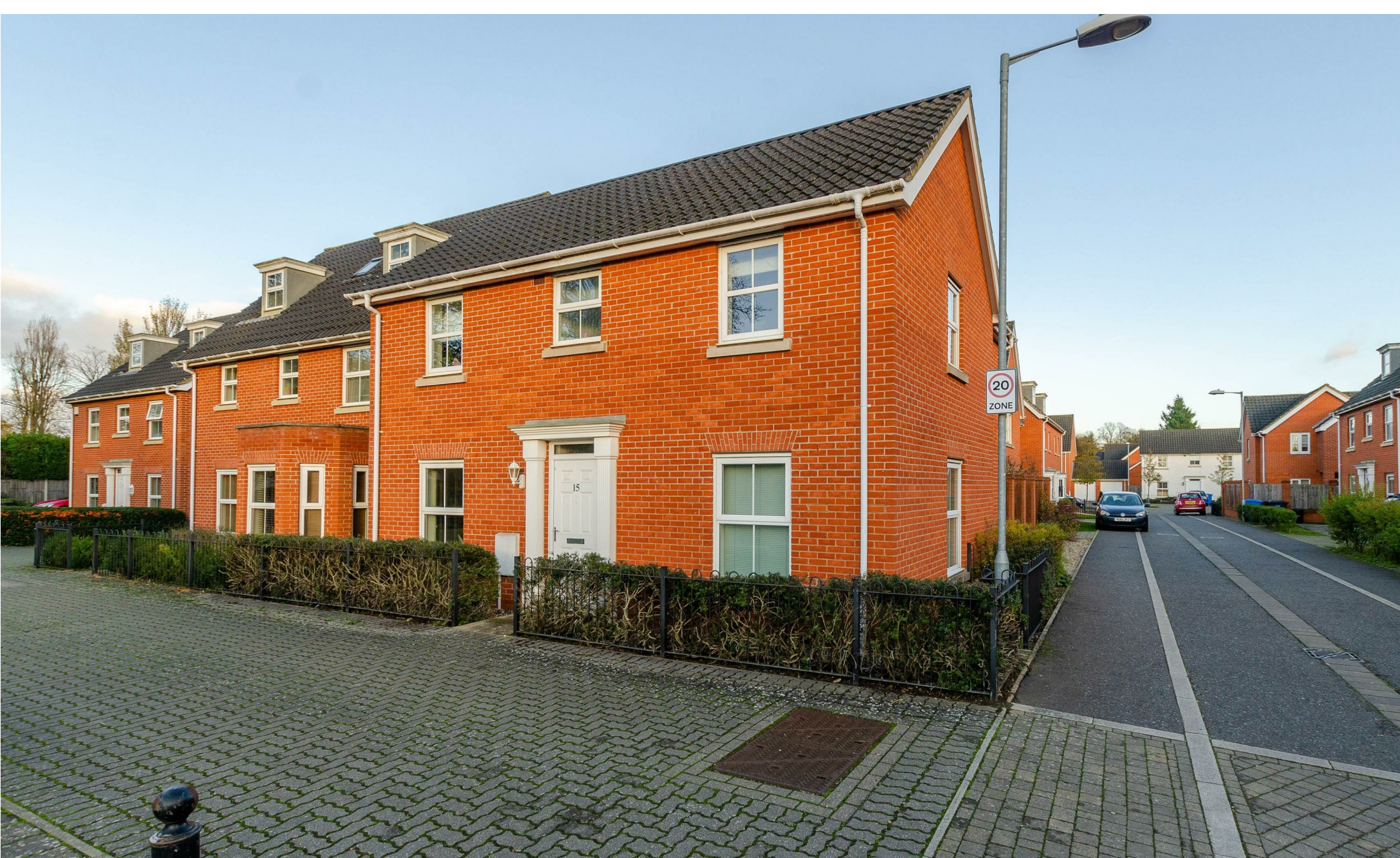
Earles Gardens| Norwich| NR4 PCM £2,964 PCM